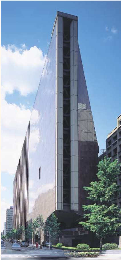
THE INDUSTRIAL BANK OF JAPAN, LIMITED