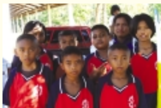
Mizuho Asian Fund

Through the cooperation of Thailand's Ministry of Education, the fund sponsors soccer and volleyball tournaments (collectively called the Mizuho Games) for elementary and junior high schools. Also, the fund has awarded scholarships to university students as well as supported company visits for elementary and junior high school students in Thailand.