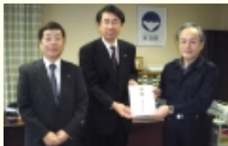
Presentation of donation for earthquake disaster in Niigata Prefecture.