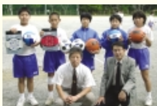
Donation by Mizuho Education Welfare Foundation of athletic equipment to an elementary school in rural Japan.

In the case of donations to earthquake-stricken Niigata Prefecture, additional funds were collected from employees through a voluntary collection drive as well as a matching donation from Mizuho Financial Group.