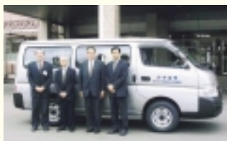
Presentation by Mizuho Welfare Foundation of vehicle for use by a welfare facility.